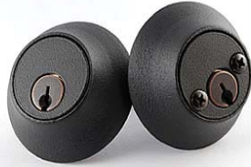
763 - Double Cylinder, 1 1/2in thk door 768 - Double Cylinder, 2 1/8in thk door