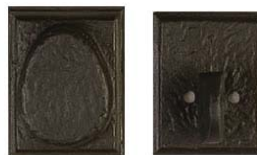
Bronze Single Cylinder Deadbolt 10325 - up to 2 1/2in door thickness