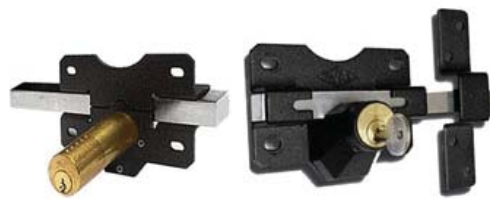
1311 - Double Cylinder Long Throw Deadbolt for Driveway Gates, Stainless / Black