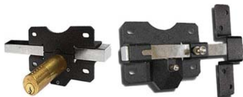
1310 - Single Cylinder Long Throw Deadbolt for Driveway Gates, Stainless / Black