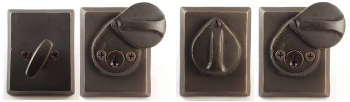
1106 - Single Cylinder, 1 1/2in thk door 1108 - Single Cylinder, 2 1/8in thk door 1109 - Double Cylinder, 2 1/8in thk door