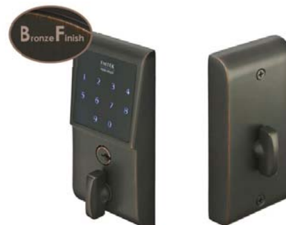
Emtek EmTouch Brass Keypad Deadbolt Brass, Oil Rubbed Bronze

1114 - 1 1/2in thick door 1115 - 2 1/8in thick door