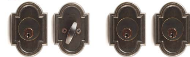
1006 - Single Cylinder, 1 1/2in thk door 1008 - Single Cylinder, 2 1/8in thk door 1007 - Double Cylinder, 1 1/2in thk door 1009 - Double Cylinder, 2 1/8in thk door