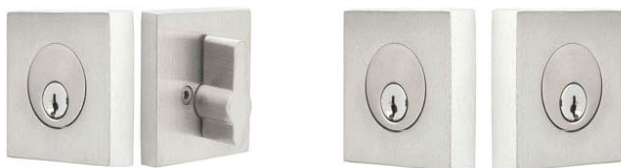
1206 - Single Cylinder, 1 1/2in thk door 1208 - Single Cylinder, 2 1/8in thk door 1207 - Double Cylinder, 1 1/2in thk door 1209 - Double Cylinder, 2 1/8in thk door