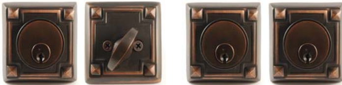
1306 - Single Cylinder, 1 1/2in thk door 1308 - Single Cylinder, 2 1/8in thk door 1307 - Double Cylinder, 1 1/2in thk door 1309 - Double Cylinder, 2 1/8in thk door