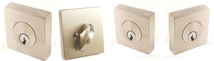
1406 - Single Cylinder, 1 1/2in thk door 1408 - Single Cylinder, 2 1/8in thk door 1407 - Double Cylinder, 1 1/2in thk door 1409 - Double Cylinder, 2 1/8in thk door