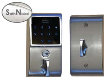
Emtek EmTouch Brass Keypad Deadbolt Brass, Satin Nickel

1110 - 1 1/2in thick door 1111 - 2 1/8in thick door