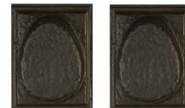
Bronze Double Cylinder Deadbolt 798 - up to 2 1/2in door thickness