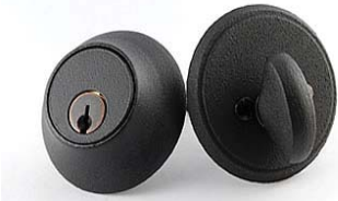
762 - Single Cylinder, 1 1/2in thk door 767 - Single Cylinder, 2 1/8in thk door