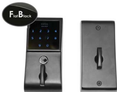
Emtek EmTouch Brass Keypad Deadbolt Brass, Flat Black

1110 - 1 1/2in thick door 1111 - 2 1/8in thick door